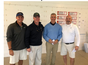
First Place Winners

Springfield Golf Club in Fort Mill, SC. Eight teams played a challenging course that was in fantastic condition. The weather was wonderful and a great time was had by all. All proceeds from this event will benefit our annual Scholarship Fund. Thank you to all who participated in the event. Our next golf outing will be in the Spring of 2019.