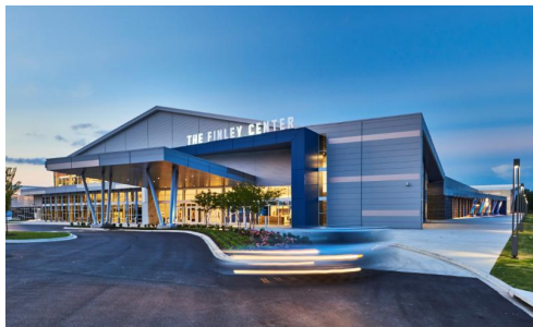
2018 Building of the Year - Hoover Sportsplex Dunn Building Company Birmingham, AL

The Building of the Year Awards are a great way to recognize Contractors and Erectors for the incredible projects they complete. Their dedication to quality and safety, the interesting features, complexity and green building elements all come into play when judging these projects. The awards ceremony will take place during the opening session where we'll be joined by MBMA members so plan now to attend this prestigious event. Submit your projects by February 15, 2019. New this year is a