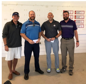
Second Place Winners